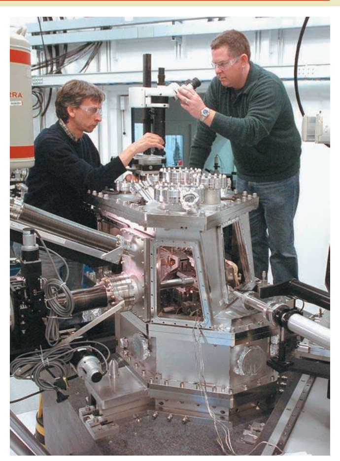
Figure 14.8 The Center for Nanoscale Materials' nanoscope, the world's most powerful X-ray microscope.

Built from the ground up, the new CNM facility enables scientists and engineers to conduct a wide variety of projects in a single location. The computing infrastructure delivers the computing power and data transfer rate required to capture and analyze large amounts of data in real time. Some experiments produce enormous amounts of data. Researchers are able to