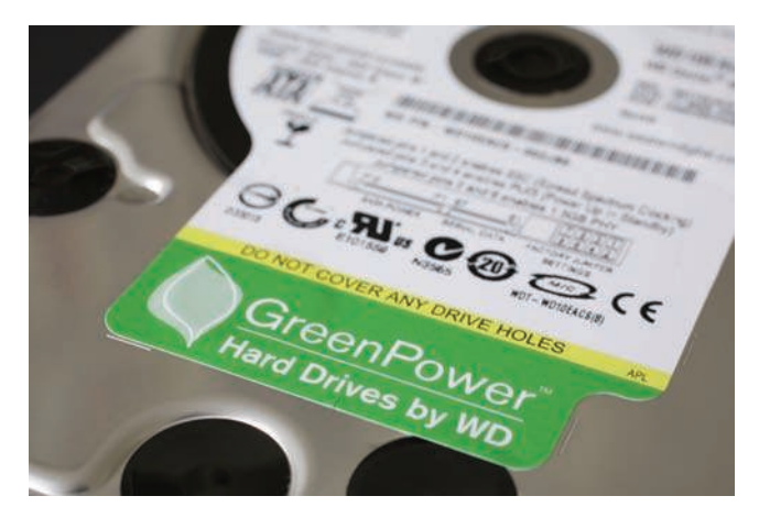
Figure 14.1 Ecofriendly computing. Computer hard drive with considerably reduced power consumption by manufacturer Western Digital.

hardware. That 2 to 3 percent can be cut in half by switching to low-emission data centers, placing them in cold climates to reduce the energy needed to cool the heatgenerating hardware, and buying ecofriendly hard drives with considerably reduced power consumption, as shown in Figure 14.1.