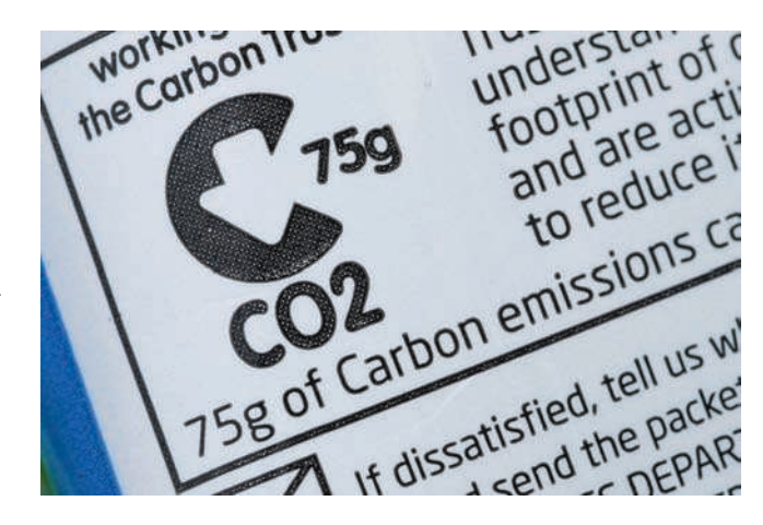
Figure 14.4 Label showing the amount of CO<sub>2</sub> emissions produced in the making of a bag of Walkers crisps in the United Kingdom.

According to analysis conducted by international management consultants McKinsey & Company, which were listed in the SMART 2020 Report: