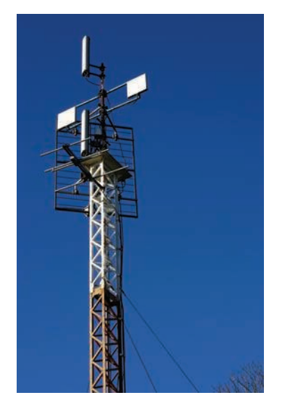
Figure 14.5 GSM cellular base station.

2. To reduce diesel fuel consumption by telecom (telecommunications) operators. Solar, wind, and sustainable biofuels would replace diesel fuel. Although diesel emits less carbon dioxide than gasoline, diesel can emit 25 to 400 times more mass